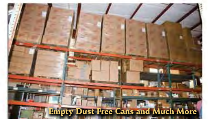
Empty Dust Free Cans and Much More