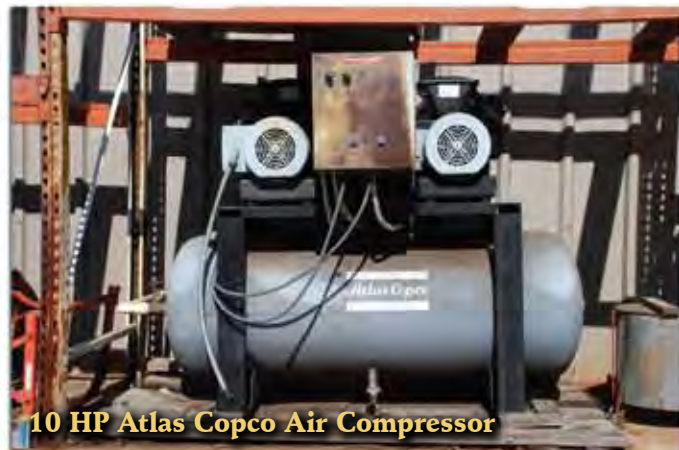
10 HP Atlas Copco Air Compressor