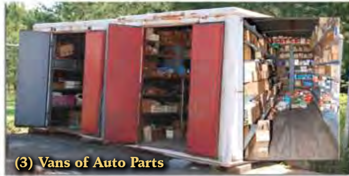
(3) Vans of Auto Parts

COMPLETE INVENTORY LIQUIDATION Wholesale Warehouse For Paint & Body Supplies More Than 60 Name Brand Manufacturers