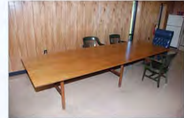
Conference Table And Other Furniture