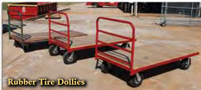
Rubber Tire Dollies