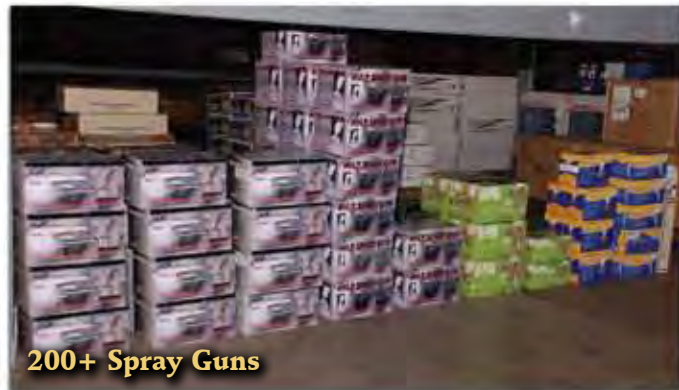
200+ Spray Guns