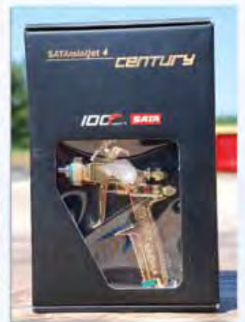
200+ Spray Guns