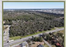
Property is north of the Marine Corps Logistics Base

Auction Day Site GPS Directions Merry Acres Event Center, 1400 Dawson Road, Albany, GA 31707